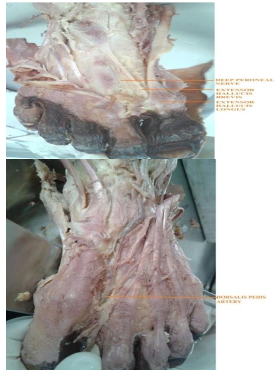
Fig. 2 Showing Structures of Dorsal Aspect of Foot